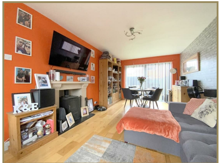
9 Rutland Drive, New Waltham, North East Lincolnshire, DN36 4PA £195,000